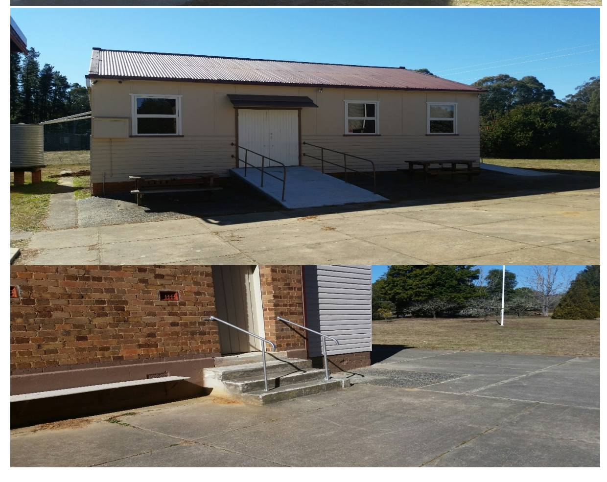
PO Box 123, Lithgow NSW, 2790