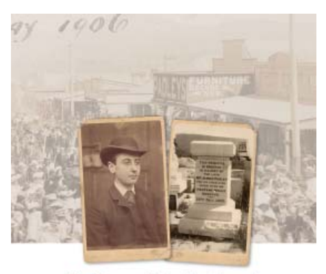
Padley of the Pedestal